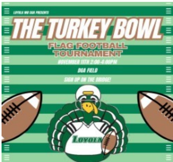
Turkey Bowl Flyer