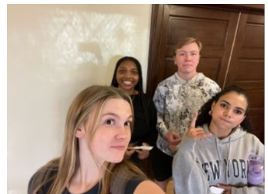
SGA members in Humanities