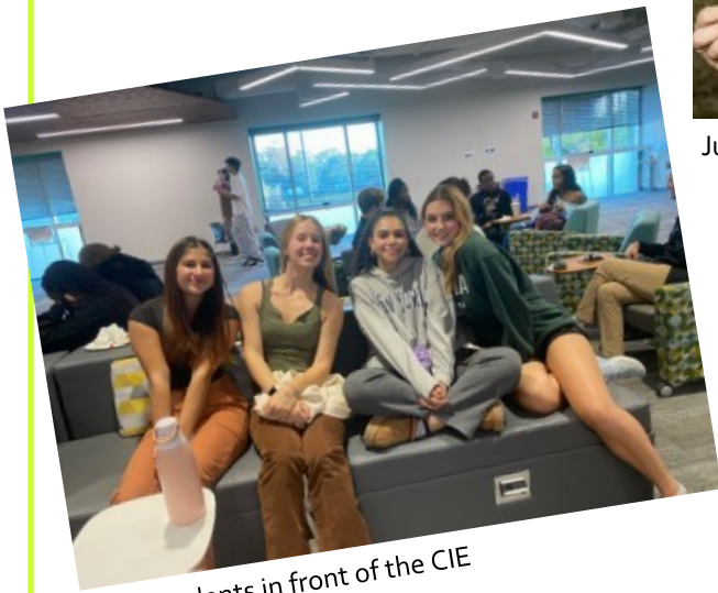
SGA students in front of the CIE