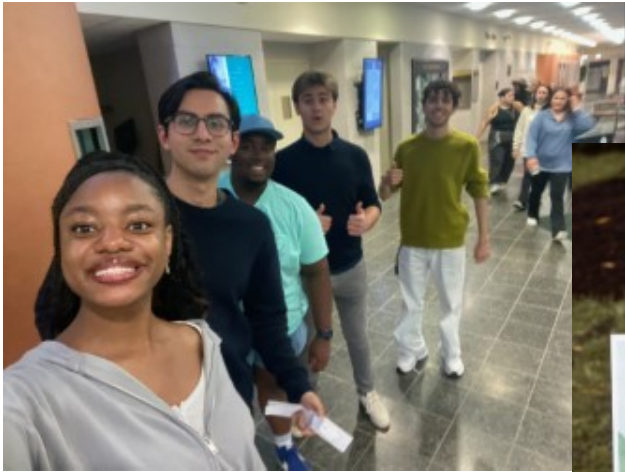
SGA students in front of McManus theater