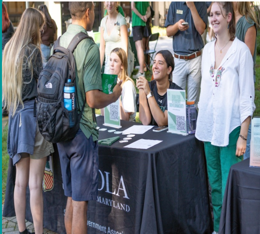
SGA students smiling and welcoming others