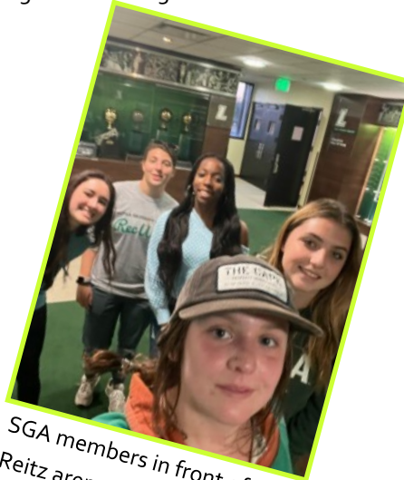
SGA members in front of the Reitz arena