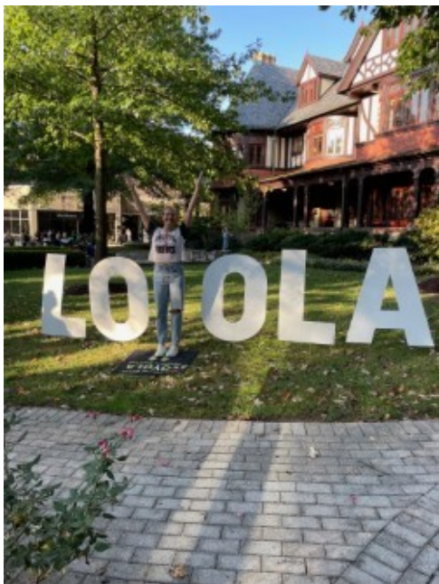
SGA student acting as the "y" in the word Loyola

The Loyola University Student Government Association (SGA) is a dynamic organization that plays a crucial role in fostering a sense of community, empowering students, and effecting change on campus. To grasp the essence of SGA's role in the Loyola community, it is essential to understand the organization's fundamental purpose: SGA acts as a representative body, providing a platform for students to share their thoughts and concerns, thereby fostering a sense of community where everyone's voice matters.