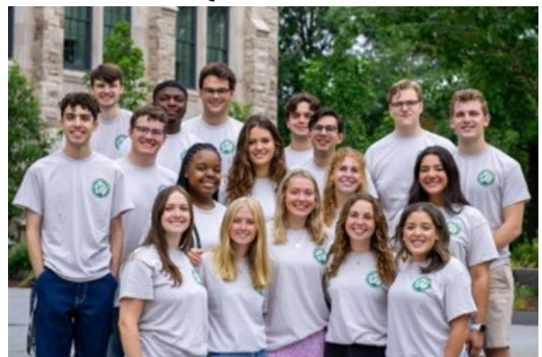
SGA Executive members