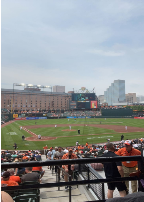
Camden Yards sits in the heart of Baltimore city.