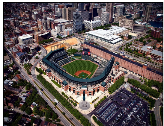
A bird's eye view of Camden Yards

College is a transformative period in your life. In these four years, you will determine the path of life which you will walk down as well as create meaningful connections with peers and professionals alike. Having chosen to go to school in Baltimore, going to an Orioles game is one of the most memorable experiences you have access to. Loyola even sponsors trips to Orioles games sporadically throughout the year. Attending an Orioles game provides an opportunity for you to bond with your peers and create lasting memories. From cheering on the O's to enjoying peanuts and cracker jack, to simply talking with friends in an ambient scene, the experience gives you a sense of belonging.