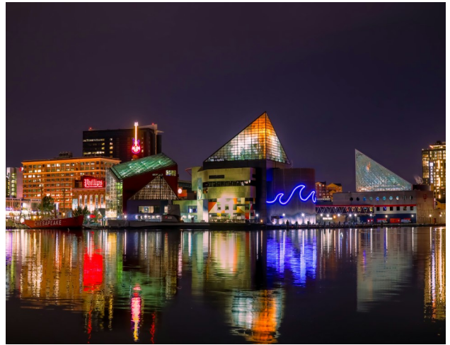
Vibrance in the city

the game contest, and even a hot dog condiment race. When Felix Bautista, the star closer of the Orioles, comes on to finish a game, the lights will flash around the field in a hypnotizing pattern. In left field, there is a section called “The Splash Zone”—every time there is a great play on the side of the home team, “Mr. Splash” will spray a water gun over the fans. The entire game is filled with entertainment. One of my earliest memories was going to an Orioles game with a sign that read “Trumbo Jumbo” for an Oriole of the time, Mark Trumbo. I won fan of the game and received a basket of goodies.