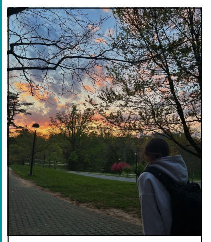
The walk to Wednesday night class