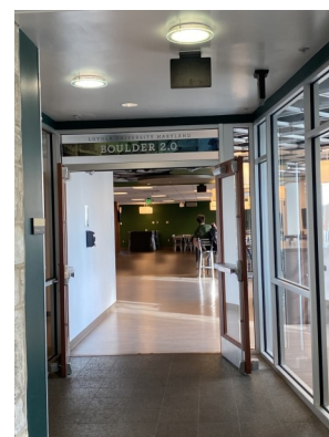
Boulder 2.0 Market Café