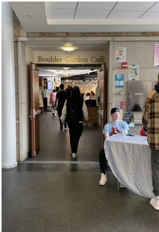
Boulder Garden Café