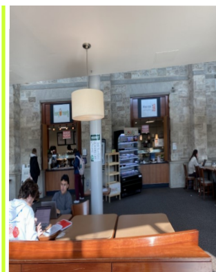
Green Peel/ Ace Sushi

This feeling of community that comes from the dining halls is also prevalent in another one of the dining halls, just above Boulder Garden Café, it's called Boulder 2.0. If the options in Boulder aren't my favorite that day or my favorite soup isn't available, I'll go to Boulder 2.0, which is directly above the Boulder Café. In the upper Boulder dining hall, there are even more options to choose from. Every day a specialty bar is made available in front of you! For example, the chicken wing bar is unbelievable. With the number of sauces available—barbeque, buffalo, and even garlic parmesan sauce—you can mix and match your wings to make one of your favorite meals at Loyola. They even have an omelet bar, which is my favorite because I have always loved a great omelet in the morning. The Chobani yogurt and Mediterranean salad bars are also favorite around campus because yogurt, to me, is all day breakfast; and that's always an advantage.