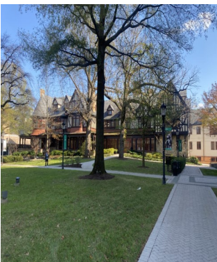
The Quad/Humanities Center