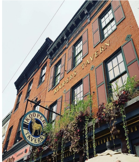
The outside brick face with plants hanging

Within the Kooper's Tavern layout, this sweet restaurant is on an adorable street which can attract tourists, giving their customers the charm of great service, with a gorgeous outside view, and appetizing food. The second floor houses a dining room which is perfect for private parties. The fireplace makes a cozier spot for guests to sit nearby.