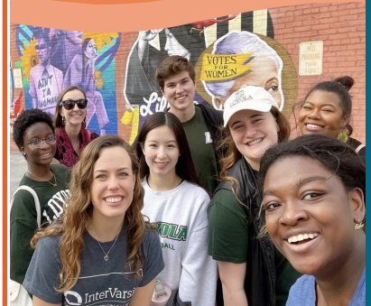
Smiling group outside at D.C. Plunge