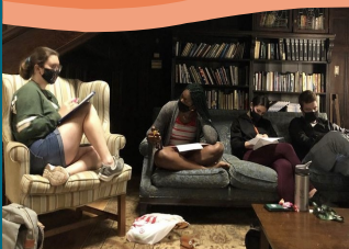
Bible Study discussion time in the HUG lounge

"College is a critical time in your life to be exploring who you are, who you are created to be, and what you believe."-Kathryn, IV Staff