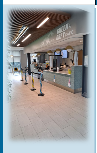
Green and Grey Café decorated for the spring