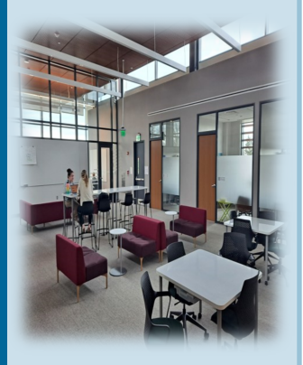
Students enjoying open space on the third floor.

"I love being near food and coffee while I am doing homework because they boost my work ethic."