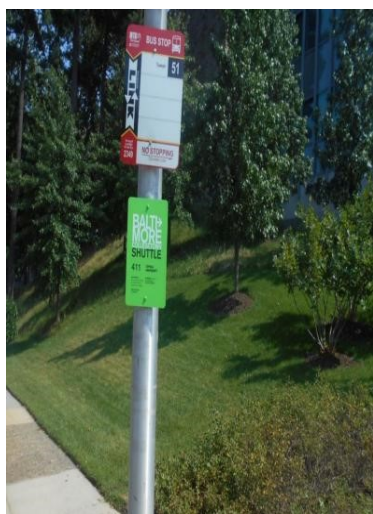
Bus stop for #51 bus

Mills train station, which is exactly where the library is. The 28 bus stop is right out of the Fernandez building but closer to the traffic lights. One great way to know how long the bus is going to be is to text the specific bus code, which is normally on the red bus stop stand, to MDMTA, which is also 68263 and the specific bus stop I am referring to right now's code is 10352. This will state when the next bus(es) are going to come, so that you don't have to wait forty minutes outside—you can just come out of the Fernandez building when there are five minutes left. You can either use the app to get a day pass or four dollars and forty cents and the pass works for the train too. So, you will get off at West Cold Spring, take the train from there and get off the Owings Mills Train Station and from the exit you take a left, a right, and the library is to your right.