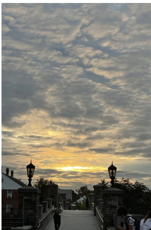
An image of the sky from Loyola's bridge.