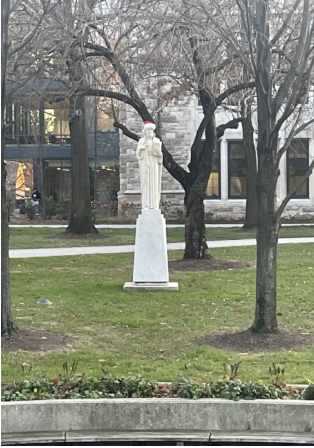
Statue of Ignatius of Loyola in the Quad