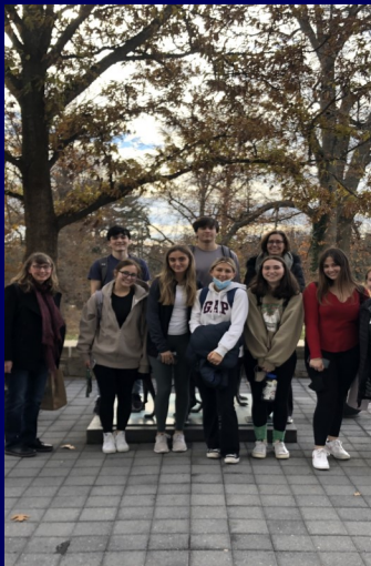
My Messina group

A program in Loyola made my transition to college smoother— Messina . Messina is a program for all first-years in which they are placed in groups of less than twenty students, and they take a course pairing throughout the year. The group will stay the same: so, you will have a group to meet, to connect with, and to become friends with. Messina also introduces you to Baltimore, the place you either already call home or that will become your home while you are in Loyola. They do activities off campus to engage students with close neighborhoods and the city surrounding campus. Messina also connects the group with the two professors, an Evergreen and a Messina advisor, people who are there to support you in everything they can. Evergreens are upper-class students who volunteer to accompany the Messina group and to be another source of support as another student.