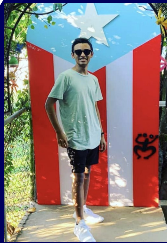
A picture of the flag of Puerto Rico.