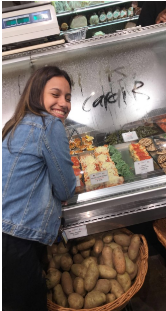
My friend getting food at Belvedere Square Market