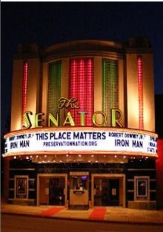
Outside the famous Senator

As you open the doors to the movie theatre you no longer feel like you are in the year 2019.