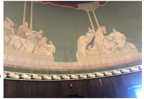
The beautiful mural

There was another time my friends and I were bored on a Friday night. We googled the movie times and saw that the brand new movie Us was playing and it was its opening weekend. We all piled into an uber that only cost us each $1.50 and adventured to the movies. We got into the large theatre and found seats that had a table in front of them. We thought it was so funny and felt we were getting the full "VIP experience." We put our feet up and enjoyed the movie in style. I got to see